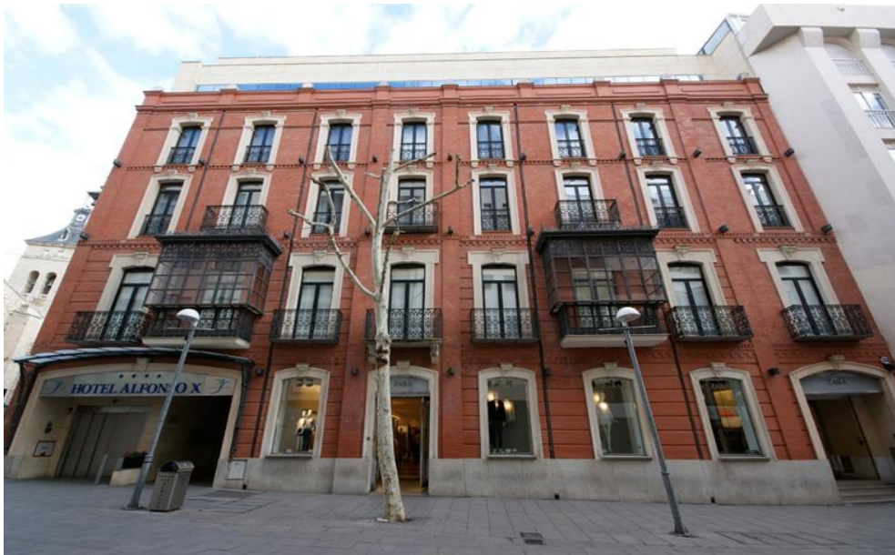
HOTEL ALFONSO X c/ CARLOS VAZQUEZ, Nº 8 13001 CIUDAD REAL +34926224281