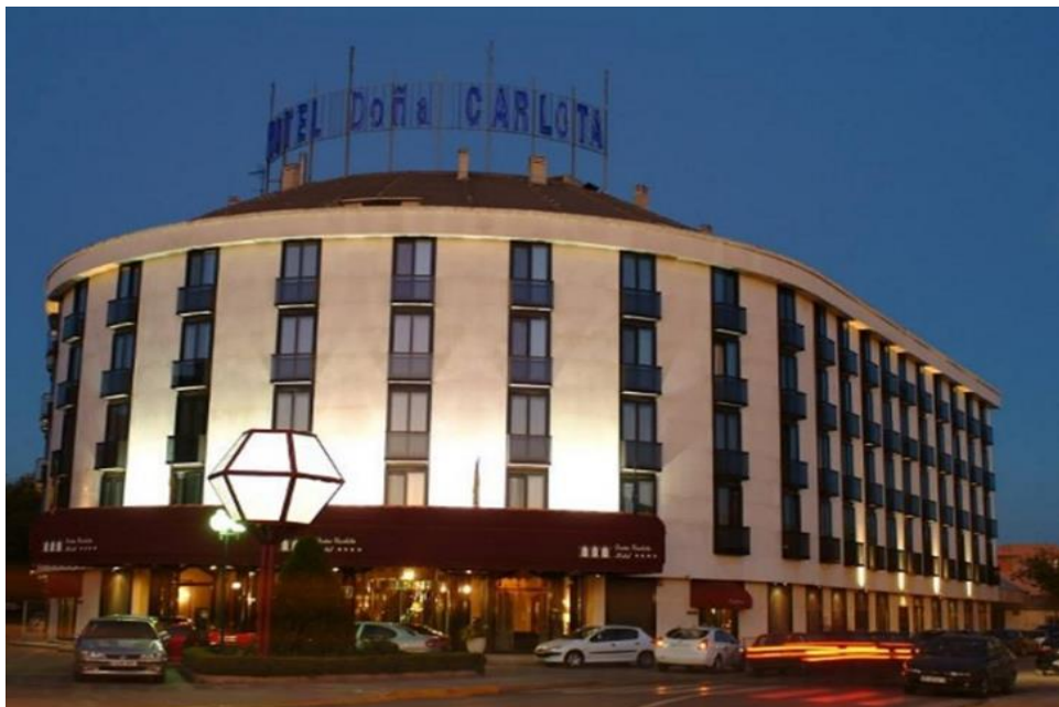
HOTEL DOÑA CARLOTA RONDA DE TOLEDO, Nº 21 13005 CIUDAD REAL +34926231610 info@hotelcarlost.es