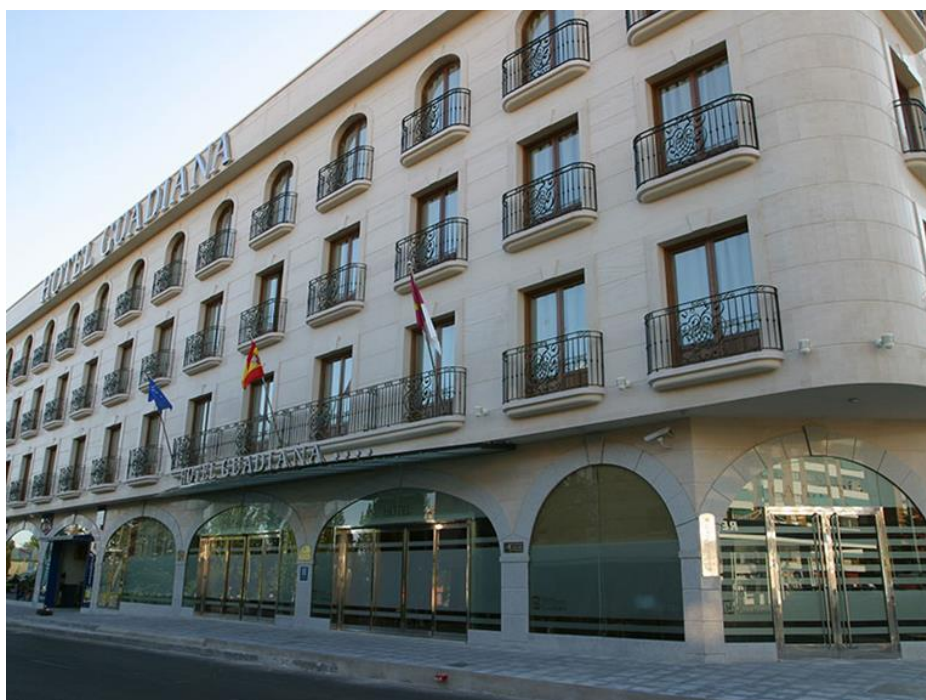
HOTEL GUADIANA C/ GUADIANA, Nº 36 13002 CIUDAD REAL +34926223313 info@hotelguadiana.es