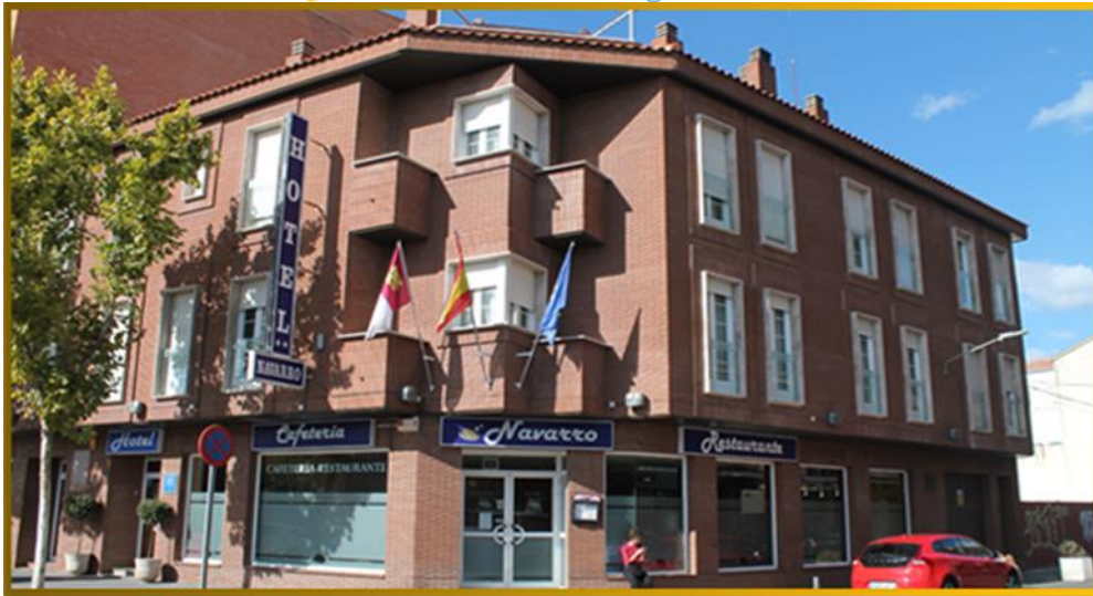
HOTEL NAVARRO AV. PIO XII, Nº 18 +34926214377 correo@hotelnavarro.es