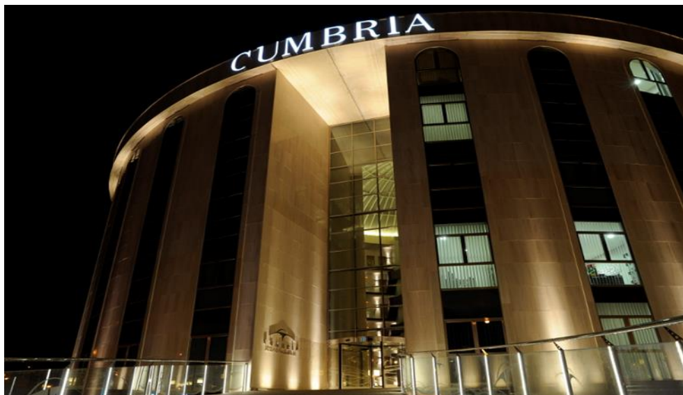
HOTEL CUMBRIA CARRETERA DE TOLEDO, Nº 26 13005 CIUDAD REAL