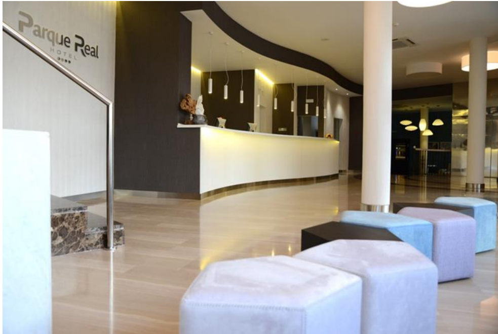
HOTEL PARQUE REAL C/ CRUZ DE LOS CASADOS, Nº 1 13002 CIUDAD REAL +34926269013 info@hhotelparquereal.es